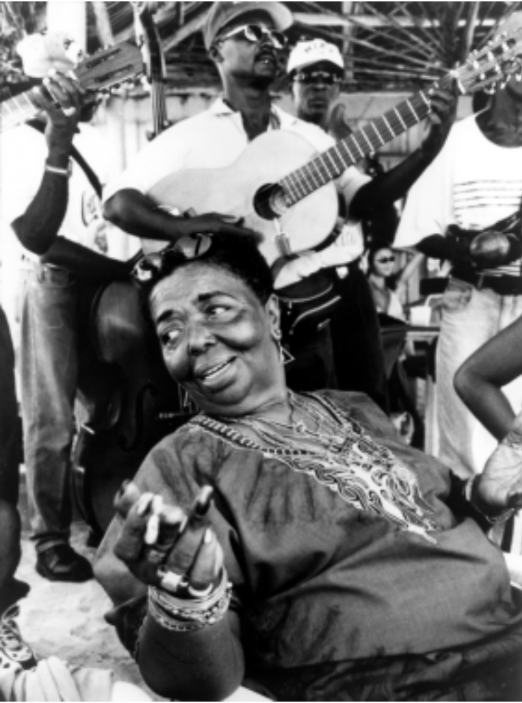
Cesaria Evora is “The Barefoot Diva,” see Music.

Whenever there is more than meets the eye, see our web site, www.upenn.edu/almanac/ .