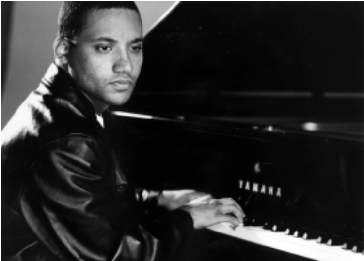
Penn Presents Grammy-nominated pianist Gonzalo Rubalcaba at Annenberg. See Music.