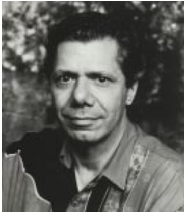
Legendary jazz pianist Chick Corea.