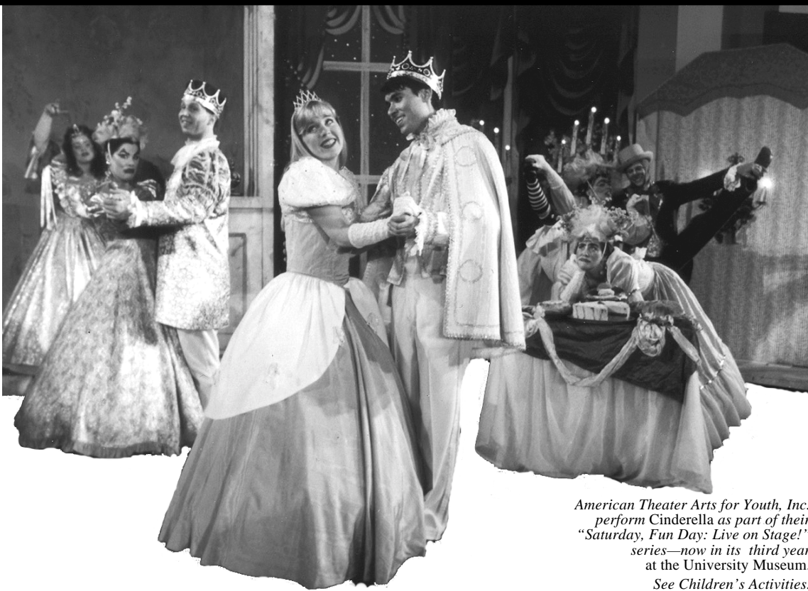
American Theater Arts for Youth, Inc. perform Cinderella as part of their "Saturday, Fun Day: Live on Stage!" series—now in its third year at the University Museum. See Children's Activities.