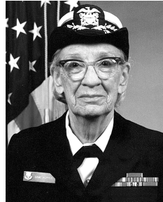
Admiral Grace Hopper