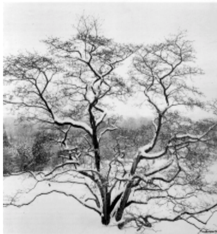
A star magnolia at the Morris Arboretum.