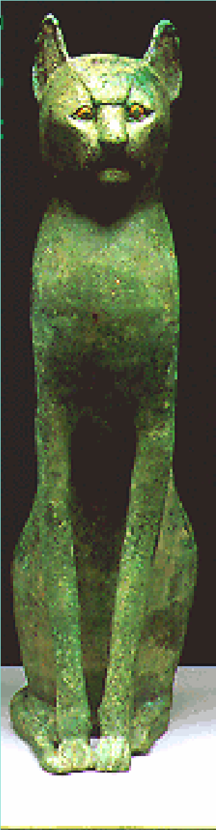
Bronze Statue of Cat, circa 954 -712 B.C.E., is among many beloved Museum treasures returning to its Egyptian Galleries. See Special Events.