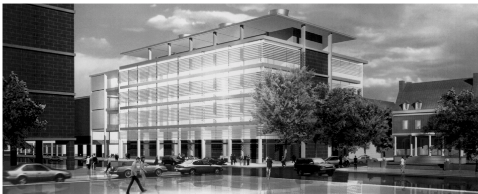
The new Veterinary School building will have laboratory modules arranged in an Open Plan, mirroring the interdisciplinary collaboration within the School's Centers of Excellence.

The School's interdisciplinary research programs will be greatly enhanced by the three laboratory floors. These will feature an open plan, fostering interaction between scientists.