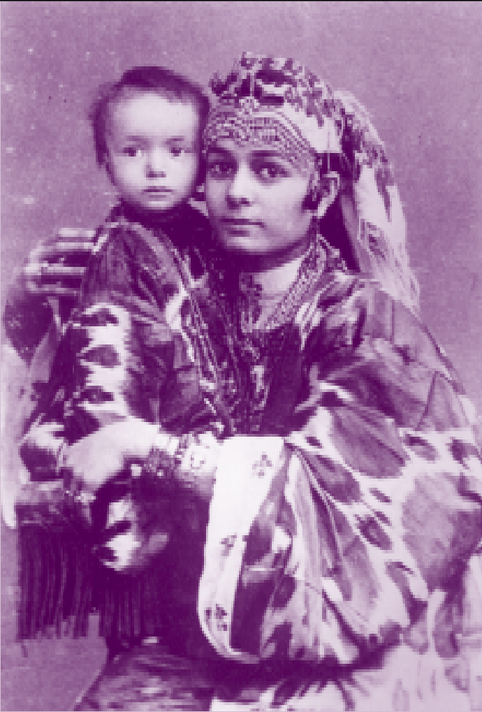
Woman in full wedding regalia with child, photograph ca. 1860, Registan Museum, Samarkand. Part of Treasures from Uzbekistan at The Arthur Ross Gallery, through February 13. See Exhibits.