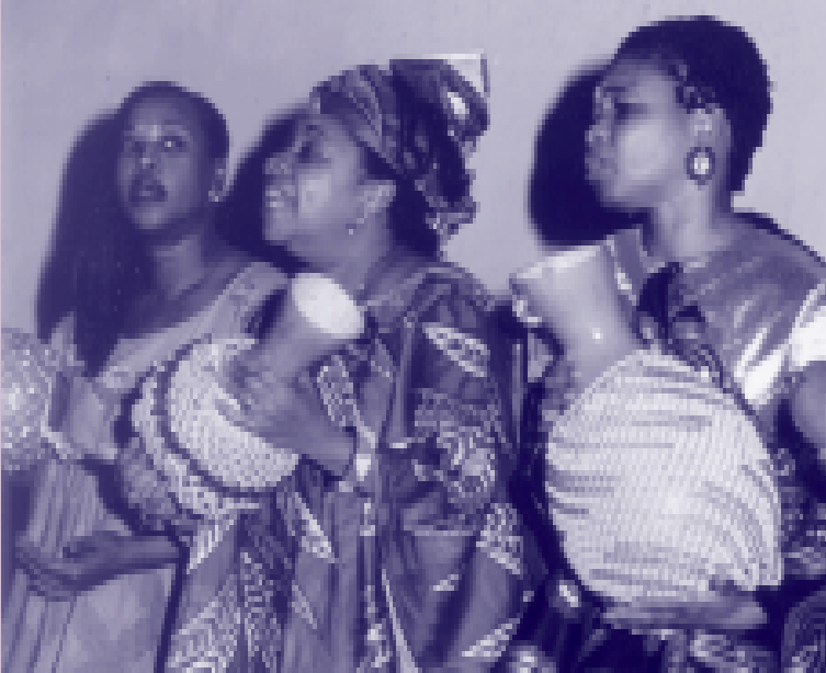
The Women's Sekere Ensemble with traditional Nigerian instruments. See Special Events.

ISC Technology Training All classes held at Sansom Place West, 2nd floor. Register: (215) 573-3102. Info: learnit@pobox.upenn.edu or www.upenn.edu/computing.isc/ttg . 17 Intermediate PowerPoint 97 19 Intermediate Access 97 21 Intermediate Filemaker Pro 4.0 for Windows 95 25 Introduction to Windows 95 26 Creating a Web Page (Intro.) 27 Introduction to Word 97 31 Introduction to Word 98 for Macintosh