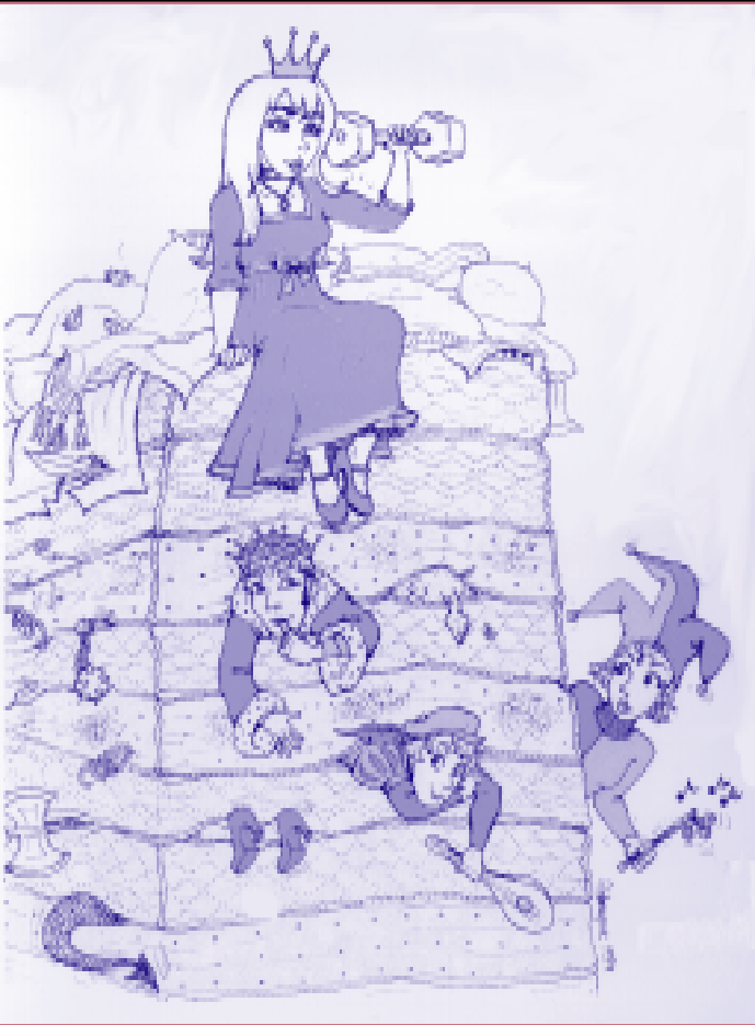
Once Upon a Mattress; A modernization of the Princess and the Pea, presented by the Penn Players. Performances December 2-4 at the Iron Gate Theatre.