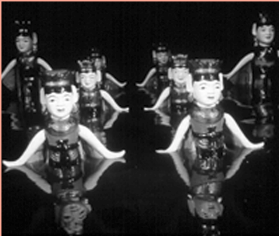
Above: The Saigon Water Puppet Theatre (Vietnam) brings puppets to life against a backdrop of traditional music at the Iron Gate Theatre.