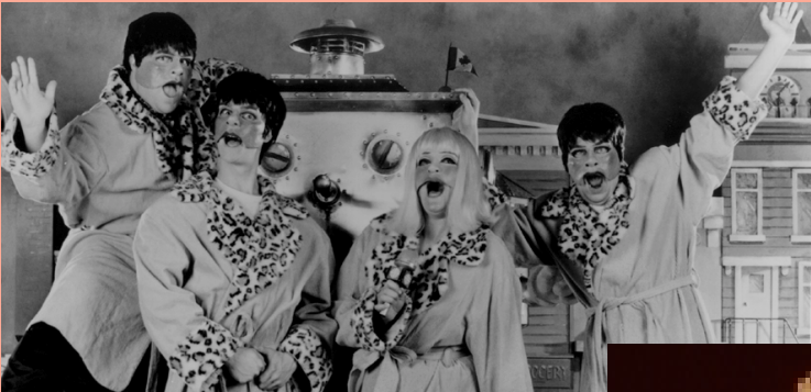
Left: Green Thumb Theater for Young People (Vancouver, Canada) perform The Beauty Machine.