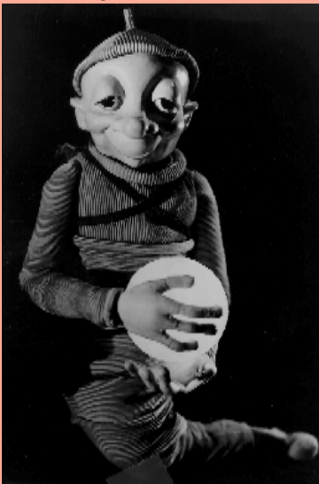
The Star Keeper