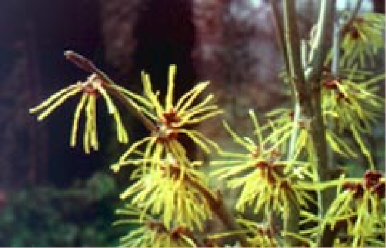
Chinese witchhazel is one of 23 different kinds of winter-blooming witchhazels you'll discover on a special walking tour at the Morris Arboretum every Sunday at 2 p.m.