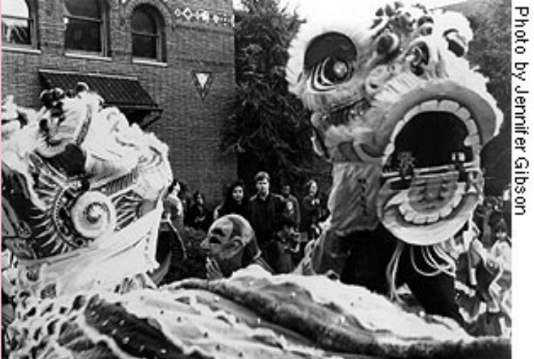
The Museum's 18th Chinese New Year Celebration kicks off the Year of the Rabbit.

Area Restaurants : many offer specials on 3rd Thursday of each month. For a list of those participating, call 1-888-GO-WEST7 or check on-line at www.gowest.org .