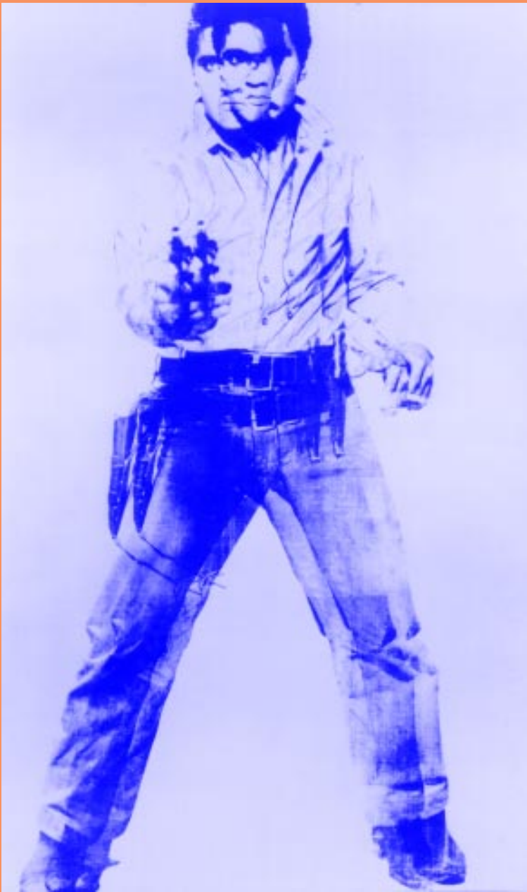
Elvis Sighted at ICA! Andy Warhol’s Double Elvis , 1963, a synthetic polymer and paint silkscreen on canvas, is in the Institute of Contemporary Art’s exhibition “ From Warhol to Mapplethorpe: Three Decades of Art at ICA. ” ( See Exhibits ).