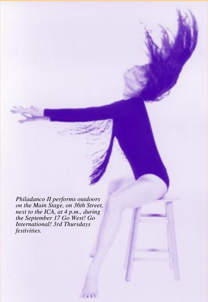
Philadanco II performs outdoors on the Main Stage, on 36th Street, next to the ICA, at 4 p.m., during the September 17 Go West! Go International! 3rd Thursdays festivities.

For more information about this month’s events and future events visit the UCD website: www.gowest.org .