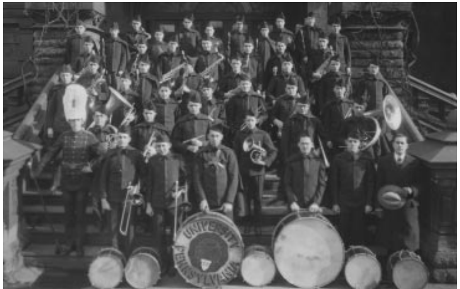
Photo of the Penn Band, c. 1920