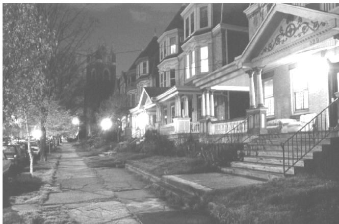
By meeting their neighbors, students are learning about the richness of the community.