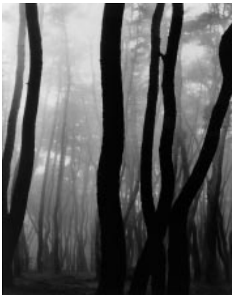
Untitled, (from Pine Tree series); a 1985 gelatin silver print by Bae Bien-U, from the ICA's upcoming Inside Out exhibit. Featuring four contemporary artists from Korea, Inside Out opens with a reception on Friday, November 7, from 9 until 11 p.m., and continues through January 4 (see November AT PENN).