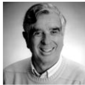
Herbert S. Wilf