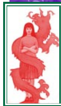
Lasting Impact: Today's cover (above) of the Maxine Hong Kingston prize- winner and a detail (left) from the 1977 edition