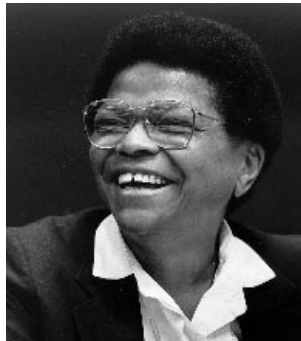
Mary Frances Berry