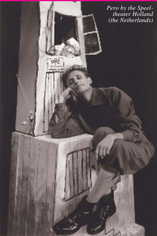
Pero by the Speel-theater Holland (the Netherlands)

Above: Panel from Belfast Frescoes, 1994, Lime fresco on slate.