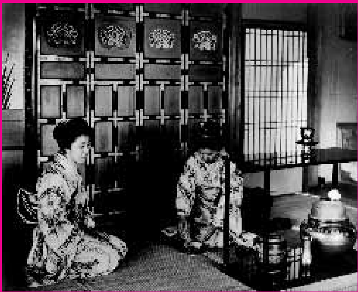
From the University Museum Archives: Photograph by Jessie Tarbox Beales of a Japanese Tea Ceremony, circa 1905.