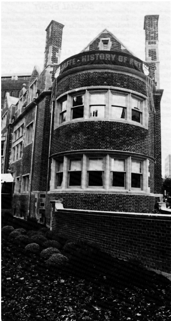
Above: The Jaffe Building as seen from the east. Below, the new wing on the western face.