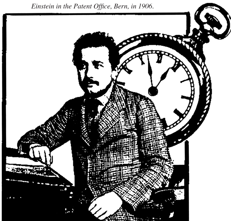
Einstein in the Patent Office, Bern, in 1906.