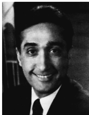
HUD's Henry Cisneros, who gives the Commencement address May 19

INSIDE • Senate Chair: Faculty Responsibility, p. 2 • SEC Agenda; A-1 Assembly and Council, p. 2 • SuperMagnet; Research Facilities, p. 3 • Transition in News/Public Affairs, p. 3 • Of Record: Employment Ad Standards, p. 4 • Competition: Logo to Paris, p. 4 • Graduate Education: New Dual Degrees, p. 5 • Grants in Humanities; for Summer Projects in the Community, p. 5 • CrimeStats, p. 7 • Deaths, p. 7 • Benchmarks: Hale Pennsylvania, p. 8 Pullouts: April at Penn Benefits: Open Enrollment