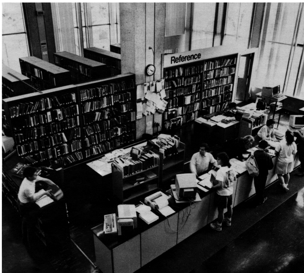
Van Pelt Library Reference Desk

Franklin, the online catalog, includes circulation status information for books in most libraries on campus. Items charged out may usually be recalled for your use. Please check with individual libraries for details of circulation policies and procedures.