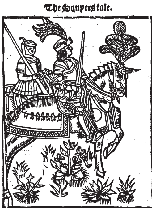
The Workes of Geffray Chaucer ... (London, 1542). Special Collections Library.

The Libraries offer a variety of formal instructional programs, such as training in the use of computerized resources (Franklin, PennData, or compact disc databases); introduction to subject-specific resources and research (for example, Lippincott's sessions on marketing or international business); and library skill workshops ("How to get the most out of the University Libraries"). Training is mandatory for Penn students who wish to search online databases at subsidized rates. The larger libraries schedule orientation tours at the beginning of each semester. Consult Van Pelt Reference or the appropriate school or departmental library for further information on instructional services.