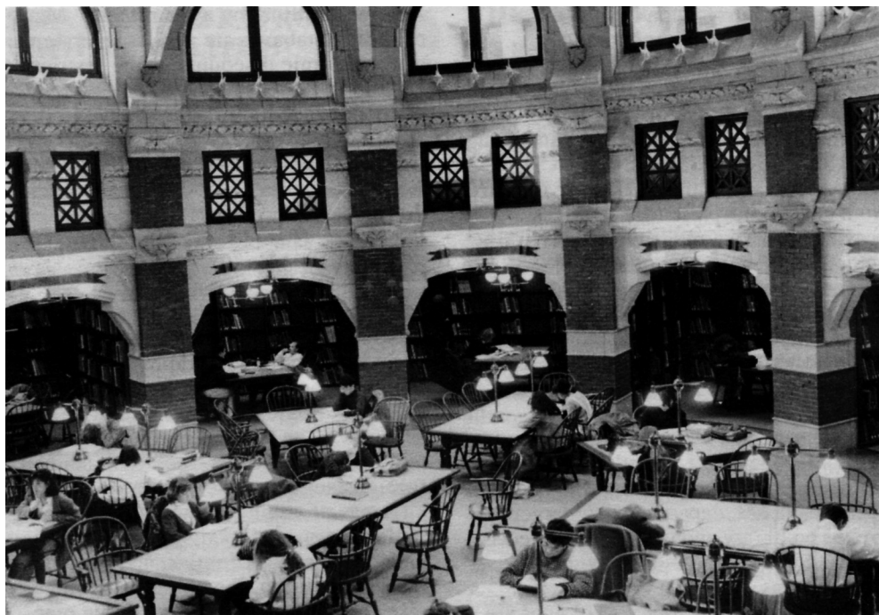
Fine Arts Library

Online searching of science and engineering databases on DIALOG and STN is available by appointment. Users may search many of these databases at significant academic discounts; some restrictions may apply. Please consult a library staff member for more information. Other electronic resources include several compact disc databases, located in the Towne building; among them are Compendex Plus (the Engineering Index), Science Citation Index, Applied Science and Technology Index, and NTIS.