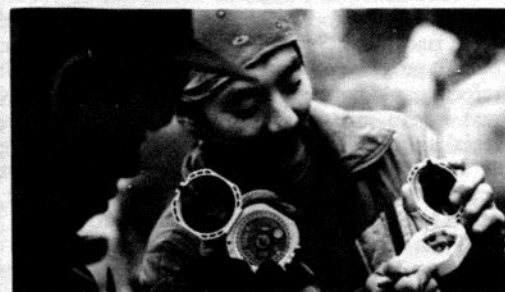
Modern-day Penn students with new measuring tools.

For information on attending, call 898-5724 or 898-5725.