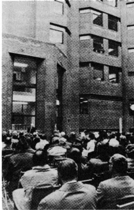
An October crowd at the dedication of Edwin B. and Leonore R. Williams Humanities and Languages Hall in 1972. The building at 37th and Spruce Streets houses the language and language-related studies of Penn.