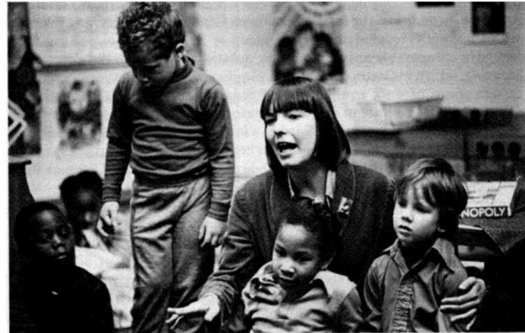
Drexel Early Childhood Center