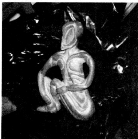
Diety by Jay Zemel; ash wood carving, 12" high, Faculty Club (see Exhibits).

W.E.B. DuBois House , 3900 Walnut Street, 9 a.m.-9 p.m.