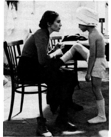
Scene from Padre Padrone , Taviani Festival (see Films).

The South Pacific Viewed and reviewed. Films are held in the Rainey Auditorium of the University Museum at 5:45-7 p.m. For more information call Ext. 4025.