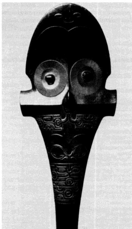
Wooden Club Head (detail) from the Marquesas Islands, in the new Polynesia exhibit at the University Museum. See story on next page.

February 10, 14 Special Members' Tour, The Many Shapes of Oriental Religion ; 2 p.m., main entrance of the University Museum. Reservations are required by calling Ext. 4045.