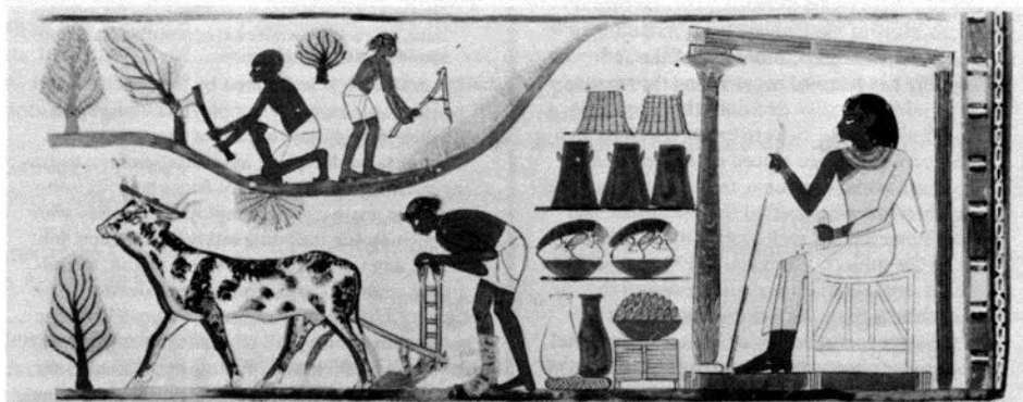
The Grain Harvest, above, is a wall painting from the tomb-chapel of Nakht, the royal scribe, in Thebes, Egypt, 18th Dynasty; c. 1420 B.C. Nakht, seated and shaded from the sun, watches his farmhands plowing and sowing the fields of his estate. The Grain Harvest is part of the University Museum's exhibition The Egyptian Mummy: Secrets and Science which has attracted more than 120,000 visitors since it opened in September 1980.

All PUC films are shown in Irvine Auditorium at 10 p.m.