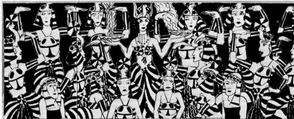
Robert Kushner's 'Drawing for Aida' (1979) will appear in the Venice Biennale.

The exhibit has been categorized into five subdivisions: site-specific works; architect's drawings and artist's buildings; decoration; language (including dance and music notations); and "new image painting." Part of the