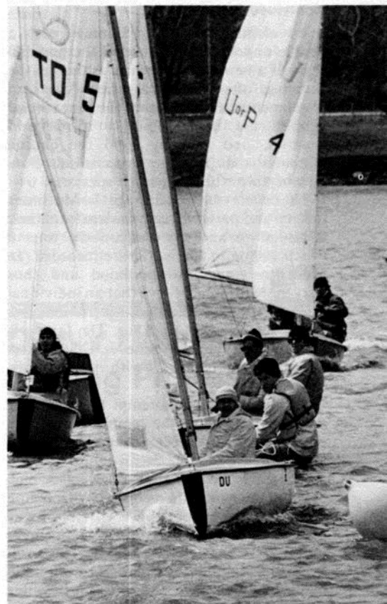
University students sail along the Schuylkill River.

Sports: Men's baseball competes against Navy at Bower Field at 3 p.m.; men's golf competes in the Ivy Tournament at Yale through Saturday; sailing team competes for the Kennedy Cup at Navy through Sunday; men's tennis competes against Navy at Lott Courts at 3 p.m.