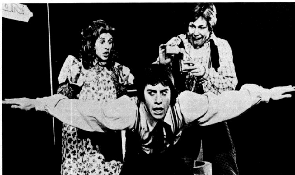
A scene from Young Tom Edison and the Magic Why , a musical about the inventor's childhood adventures. The production is from the Performing Arts Repertory Theatre and is part of the Annenberg Center's "Theatre for Children" series. There will be two daytime performances on April 25, and two on April 26 in the Zellerbach Theatre.