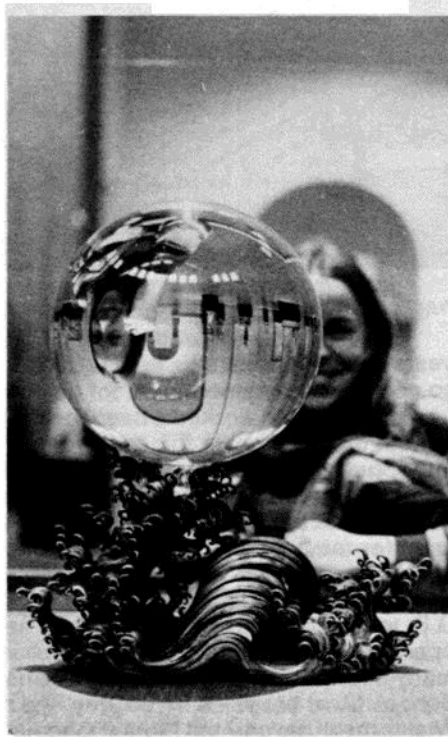
A priceless artifact, this crystal ball of a Chinese empress is one of the Museum's favorite attractions.

For the Christmas season there will be special features. The Faculty of Arts and Sciences Christmas Tree is in the rotunda. The Pyramid shop for children