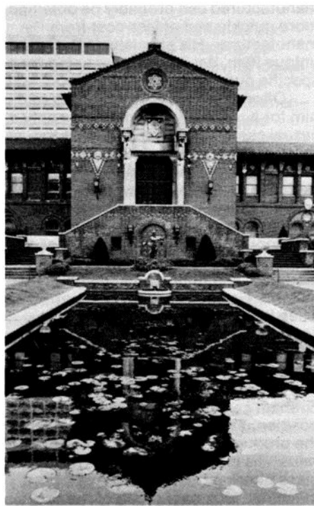
A view of the University Museum and its reflection.

The true Museum aficionado may prefer reproductions of items on display in the Museum. If so, there are also available casts of a Mayan vase, a Chinese pottery horse, an Indian lion, and a host of other items. Or, for a change of pace, there are ancient games to be enjoyed.