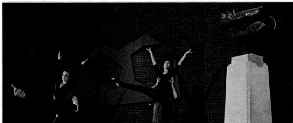
The Sculpture Lobby leading to the Zellerbach Theatre provides ample rehearsal space for the Penn Players preparing for their November production of PIPPIN."

One of the Annenberg Center's proudest achievements is the growth of student involvement and educational programs. The student performing arts organizations that rehearse and perform at the Center give us a unique vitality. We learn and grow as the students' needs and interests lead to the development of new programs which enhance the students' development as the performers, managers, researchers, and audiences of the future.