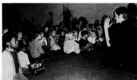
Each year Penn Players Children's Theatre Troupes reach over 10,000 children, surprising and delighting them with their creative presentations.

But there is a third audience that we seek out—that part of the population who, because of financial, physical or cultural