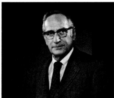
KARSH OF OTTOWA

Beard or no? Trustees were taking bets . . . (see page 3)