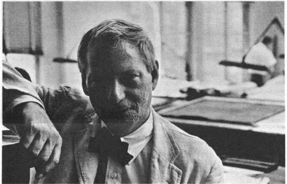
Louis I. Kahn, the new Paul Philippe Cret Professor of Architecture.

Kahn was named a fellow of the American Institute of Architects in 1951. He has also served as president of the American Society of Planners and Architects. Yale, the University of North Carolina, and Polytechnic Institute of Milan, Italy, have awarded him honorary doctoral degrees.