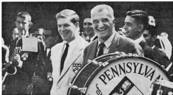
The President smiles happily as he is serenaded by members of the University Band at his anniversary "party" on October 5.